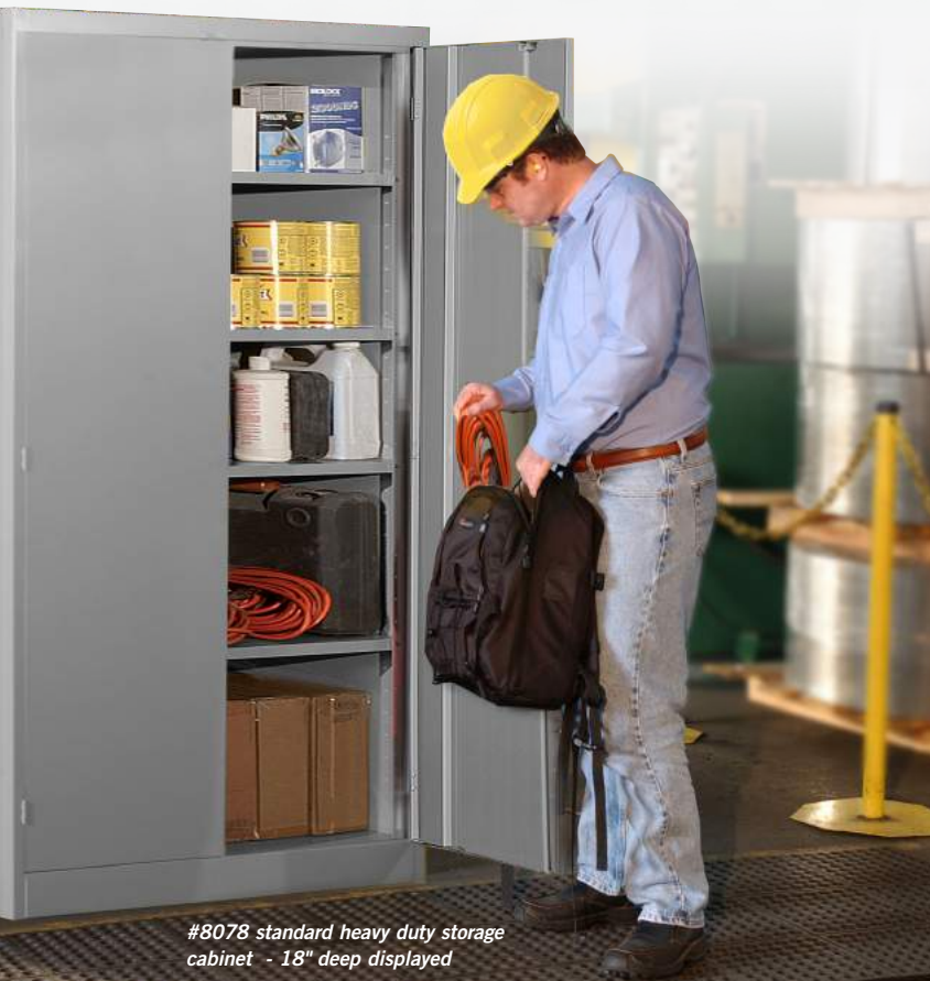
#8078 standard heavy duty storage cabinet - 18" deep displayed

Volume Discount Pricing Available at Lockers.com !