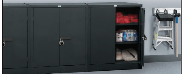
#8048 heavy duty storage cabinets with optional combination padlocks (#8120) displayed

Constructed of 14 gauge steel, Salsbury counter height heavy duty storage cabinets (#8048) offer versatile applications and are ideal for garages, institutions, schools and other environments where an industrial strength heavy duty storage cabinet is needed. Measuring 36" wide, 42" high and 18" deep, two (2) door counter height heavy duty storage cabinets are available in a gray, tan or black powder coated finish and include two (2) adjustable shelves that can accommodate contents up to 300 pounds per shelf evenly distributed. Doors are 17" wide and feature a channel reinforced design for added strength and security. Each cabinet includes a heavy duty 4" steel handle with a built-in three (3) point locking mechanism and can accommodate a built-in lock (#8110 for combination and #8115 for key) and padlock (#8120 for combination and #8125 for key).