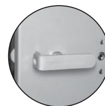
Heavy duty 4" steel handle