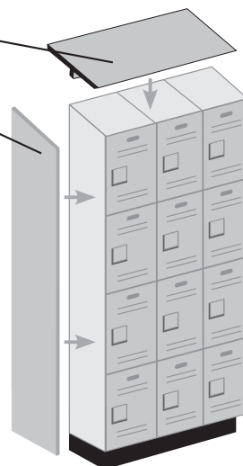
(Four Tier Displayed)

All lockers are 12" wide and locker doors include a stainless steel hasp for locking - padlocks (#44420 for combination and #44425 for key) are available as an option upon request.