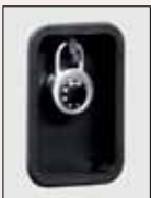
Sample recessed hasp with combination padlock (#33320) displayed

Our design engineers are available to architects, specification writers and individuals involved in the design of locker room facilities, gyms and spas.