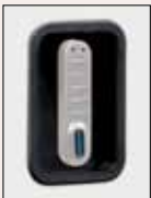
Sample electronic lock (#33390) displayed