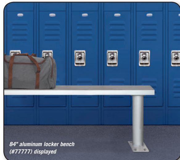
84" aluminum locker bench (#77777) displayed

Constructed entirely of aluminum, Salsbury aluminum locker benches combine a traditional look with strength and durability and are an excellent addition to industrial, office or recreational locker room facilities. The anodized aluminum seating area is 1-3/4" thick and features rounded edges for comfortable seating. Aluminum locker benches are available in six (6) lengths ranging from 36" to 96" in one foot increments and are easily assembled. Each bench is 18" H x 10" D and includes two (2) 3" diameter bolt mounted pedestals with four (4) mounting holes to secure to the ground. Pedestals feature a durable powder coated aluminum finish. Minor assembly is required.